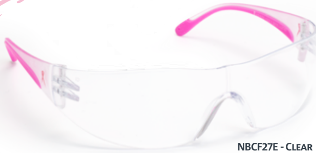
NBCF27E - CLEAR