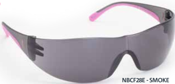
NBCF28E - SMOKE